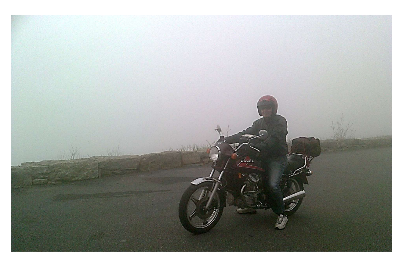
How about that fantastic view? We were literally 'in the clouds'.

so we pressed on, stopping to rest once or twice but totally robbed of the scenery that we came for. We exited at the first opportunity after 35 miles. Immediately the sun came out and we enjoyed some excellent riding and great views; all was not lost. Skyline Drive will still be there next time, and hopefully the sun will cooperate.