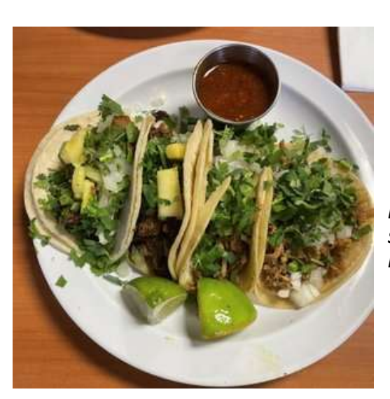
Left is lunch at stop #4. Kennett Square is renowned for authentic Mexican food.

3<sup>RD</sup> stop at Right: The Smallest Church in the World